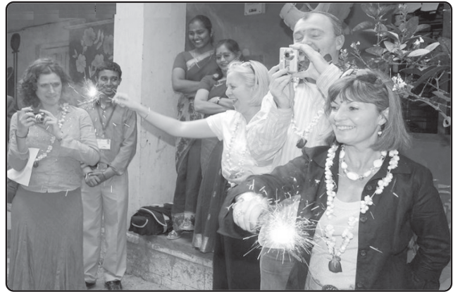
Sparkles & Smiles - Diwali for the delegation

friendliness of all the students and staff. They witnessed the Ballet which presented the Festivals such as Ganesh Chaurthi from Maharashtra, Onam from Kerala, Durga Pooja from Eastern region and Holi from the North. The traditions involved in all these festivals along with food items and gift articles created by Abhyasa students were a Feast to eyes. They were so impressed that they extended an invitation to 10 Abhyasites to participate in the WORLD PEACE conference to be held on 16 th and 17 th of October, 2008 at London.