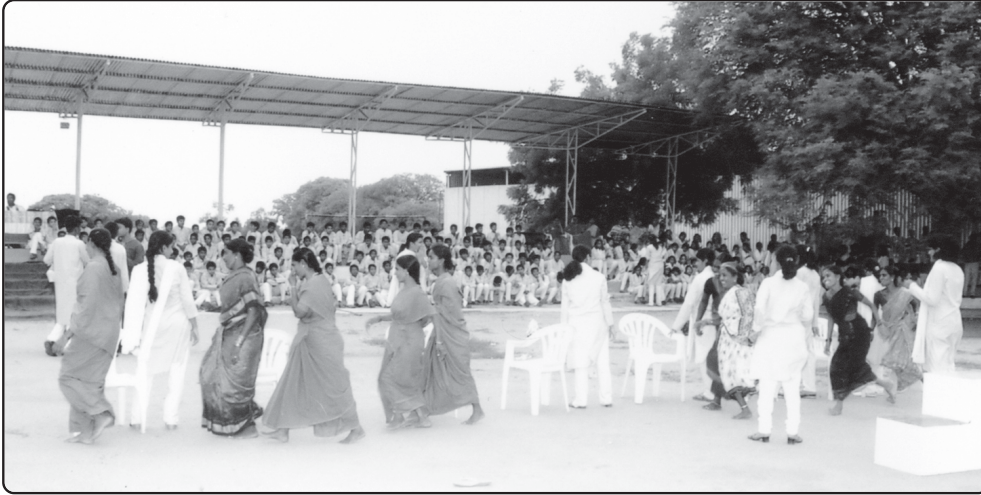
One... two... three... go ... Its the for Villagers day out.