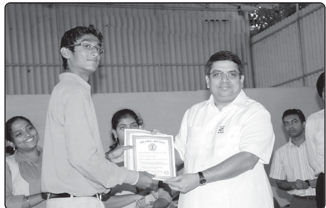
New Step towards Perfection

At the prize distribution ceremony on 2 nd August 2008, the announcement to start an Interact Club at Abhyasa was made. The over whelming response resulted in the total membership of 99 who also underwent an orientation programme of Interact Club on 13 th September 2008.