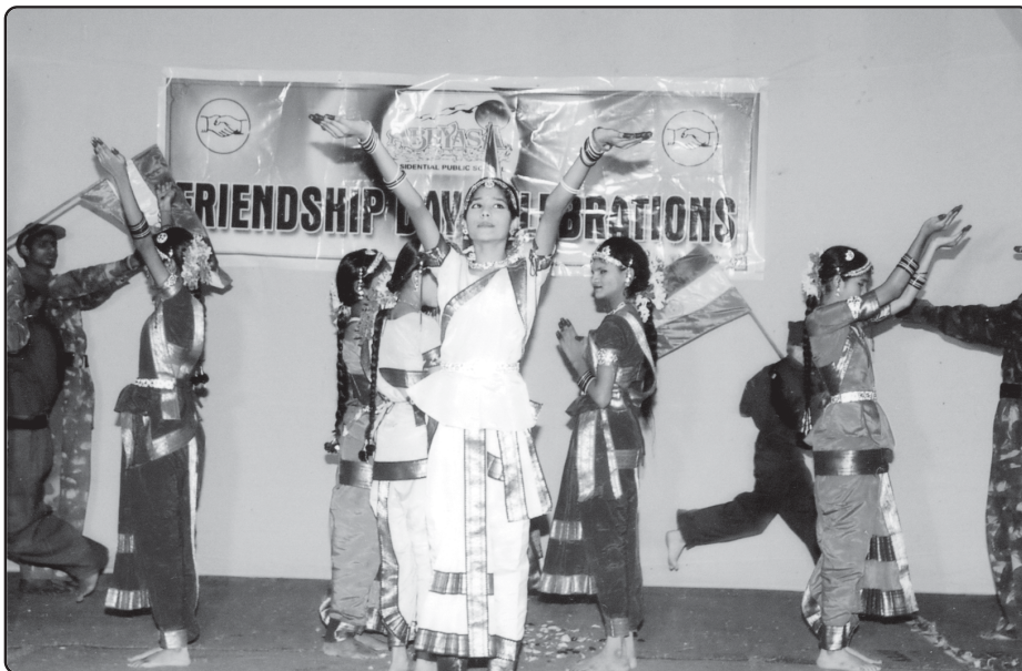
Friends from Sunetra School, performing for Abhyasites on Friendship Day

3) The day also happens to be the Friendship Day. This year it was celebrated with a different touch. All Abhyasites are already friends to each other, hence, they invited friends from outside and these friends were Visually Challenged persons from Sunetra Blind School at Ibrahimpatnam. They received a warm and traditional welcome from the students of Abhyasa. Later the Visually Challenged students, entertained the Abhyasa students with a Music concert and dance programme. The Group Dance performance was mind boggling, as they moved