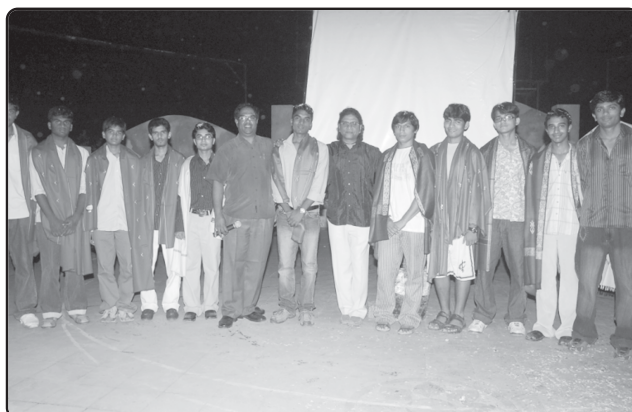
Captains & Managers with Principal & Vice-Principal