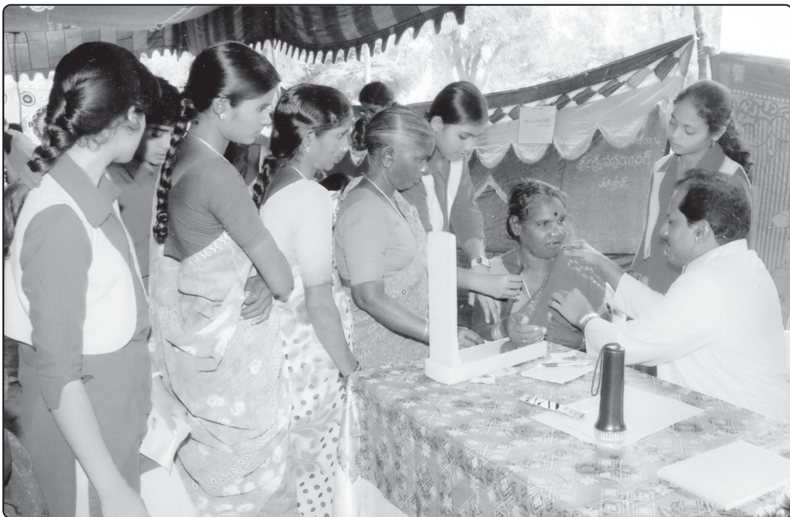
A glimpse of the Medical Camp organised by Abhyasa

On 18 th of July Medical camp was conducted by Abhyasa for the people of Toopran. We had Doctors coming from Hyderabad to treat the patients. We had Dentists, Orthopedic, General Physicians, ENT's , Gynecologists etc. i.e. to help the patients. Thanks to the participation of Doctor Parents, the camp was a success. They were also provided medicines free of cost and also they were served Phulihora and sweets.