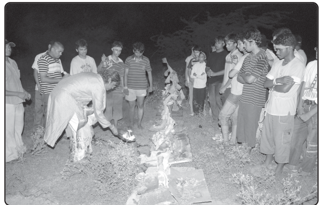
Jai Bolo Shree Ganesh Maharaj Ki... bidding farewell to the God