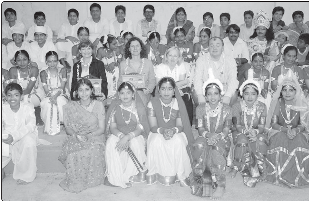
INCREDIBLE INDIA! A colourful memoir for the delegation.