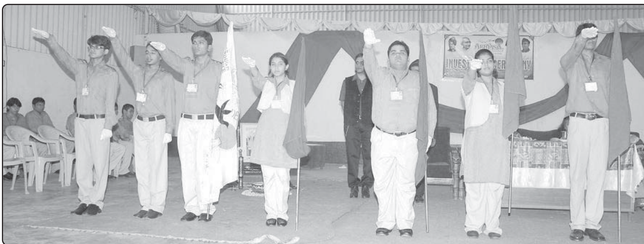
I swear in the name of God.... School captains and house captains for the year 2008-09