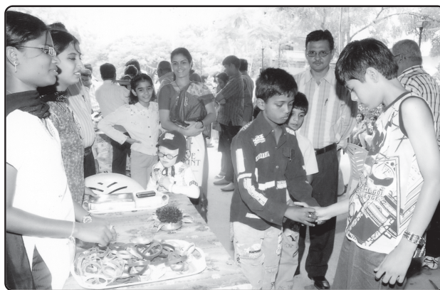
WELCOME INTO OUR NEW HOME - ABHYASA : Abhyasa's way of Welcoming New Students.